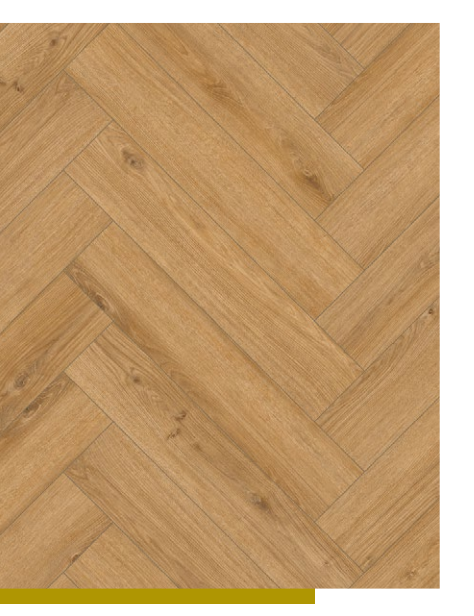
PRADES OAK 643 x 131 x 8 mm