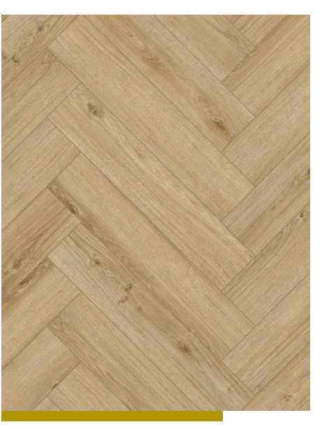
63271 JUNEDA OAK 643 x 131 x 8 mm