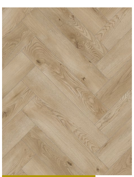
63265 ORPESA OAK 643 x 131 x 8 mm