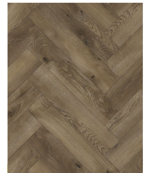
BURRIANA OAK 643 x 131 x 8 mm