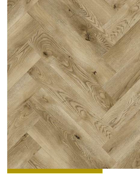
63268 PERELLO OAK 643 x 131 x 8 mm