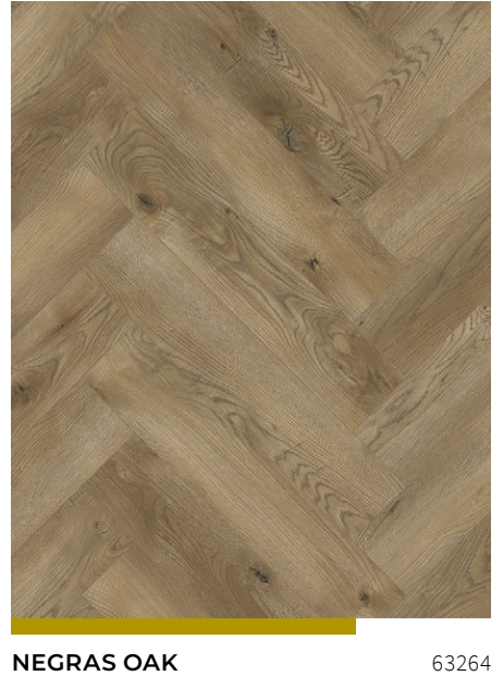
63263 NEGRAS OAK 643 x 131 x 8 mm