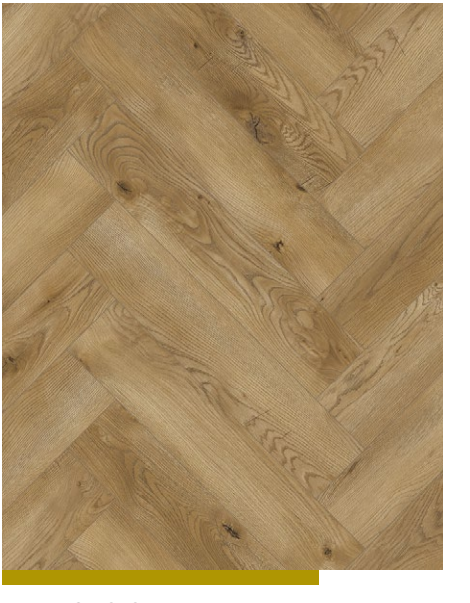
63262 ALMAGRO OAK 643 x 131 x 8 mm