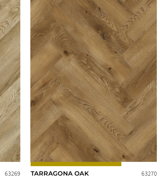
643 x 131 x 8 mm