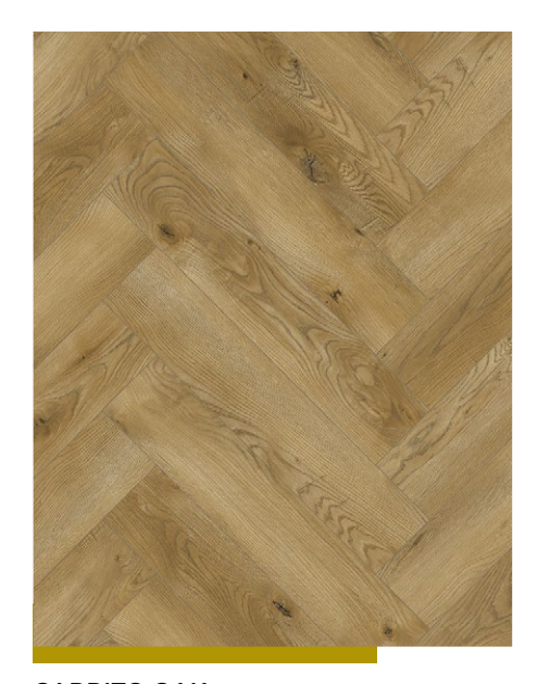
CARRITO OAK 643 x 131 x 8 mm